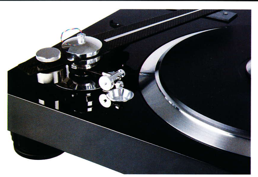
ABOVE: No challenge to those who know unipivots, but read the instructions when setting it up; exposed wires, though, tend to detract from the look of the arm

that makes you forget/forgive its single-channel status. The crashing, smashing drum attacks from 1m 29s onward reveal a punch, power and force that will jolt you from any reverie the first minute created.